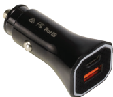
Car Charger/ USB Power adapter