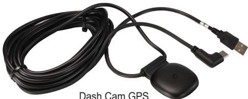
Dash Cam GPS power cable