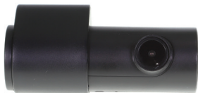
Gator Dash Cam