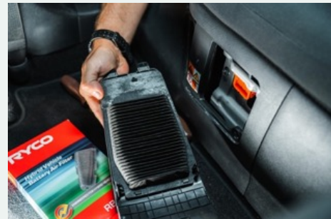
STEP 5A Once flap is released, remove old battery filter by releasing the filter from the tabs holding it in place by pulling away from OEM housing flap. Then install new battery air filter in same orientation as old filter was installed.