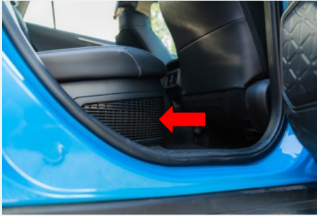
STEP 1 Location of battery air filter is on drivers side, underneath rear passenger seat.