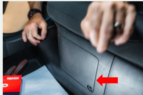
STEP 4A Using flat head screw driver or hands, wedge in-between around perimeter of battery filter OEM housing flap and back seat to begin removal of housing flap - then gently pull open flap to release remaining tabs.