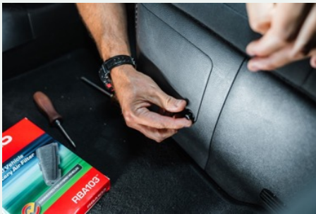
STEP 3 Remove locking clip that was held in by phillips screw.