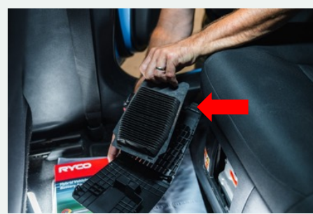
STEP 6 Repeat above steps in reverse to re-install OEM battery air filter housing flap.