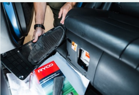
STEP 5B Once flap is released, remove old battery filter by releasing the filter from the tabs holding it in place by pulling away from OEM housing flap. Then install new battery air filter in same orientation as old filter was installed.