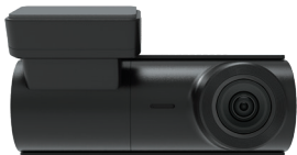
Gator Dash Cam