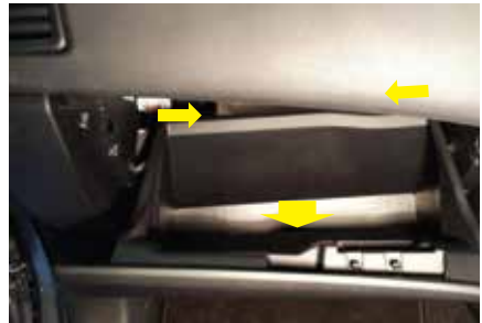
With the strut unclipped, proceed to release the glove box from its securing hinge. Simply apply some pressure to the far upper corners towards the inside of the compartment as indicated in the pic and slowly drop the unit.